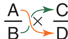
FIGURE 5.1 Cross-multiplication.

Cross-multiplication is the multiplication of the numerator of the first fraction by the denominator of the second fraction, and the multiplication of the denominator of the first fraction by the numerator of the second fraction (see FIGURE 5.1 ). Cross-multiplication is used frequently within pharmacy practice to determine correct doses