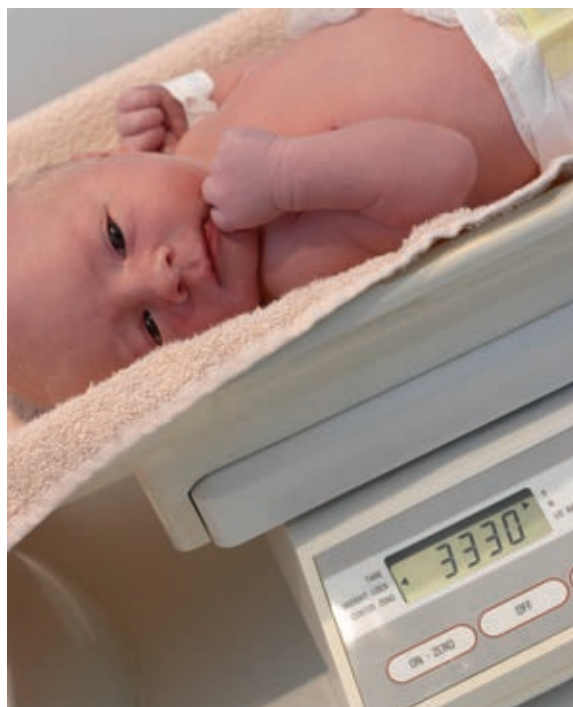
Doses based on body weight are often most accurate for pediatric patients.