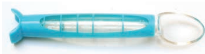
Calibrated spoons and droppers for medications administered by mouth often display household and metric units.

Instructions to patients are often provided in the household measuring system. In these cases, pharmacy representatives should caution patients, because household measuring instruments vary considerably in their actual capacity.